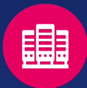
DATA CENTER MONITORING