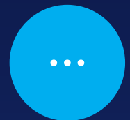
AND MANY MORE