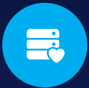
SERVER HEALTH MONITORING