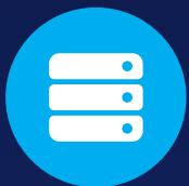
SERVER ROOM MONITORING