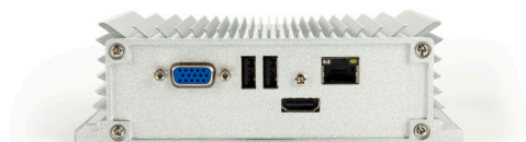
BBNA141i Front Panel